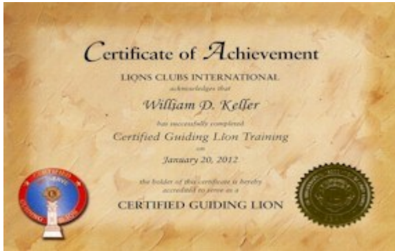
CGL Certificate of Achievement