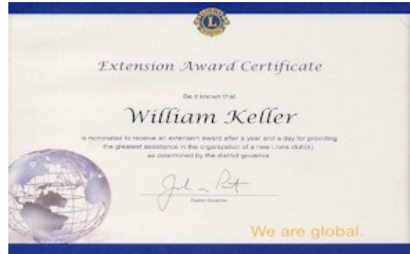
Extension Award Certificate