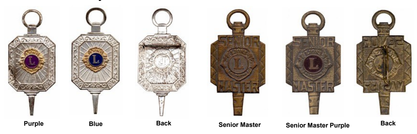
3" Long Membership Key Variations. Circa???? currently being researched.