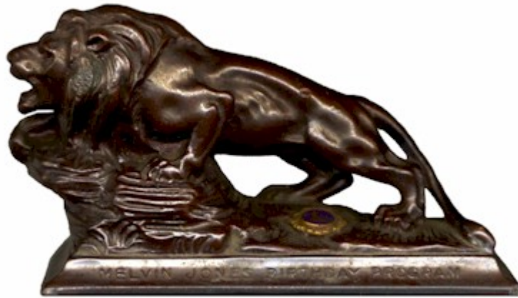
Melvin Jones Birthday Program "Forged"