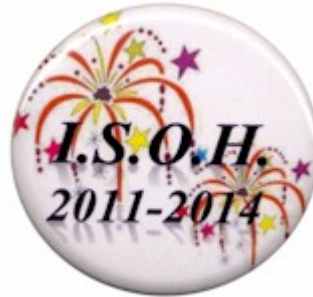
1st VDG's Button 2011-2014