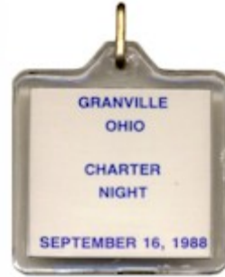
13K-Granville Key Chain