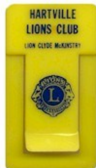
District 13D Hartville Press on Paper Clip