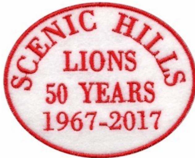
Scenic Hills 50th Annv. Club Patch.