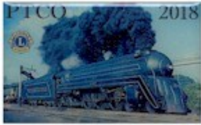
2018 Train Series Pin #5