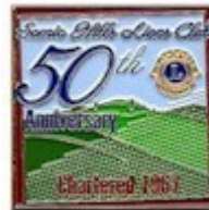
Scenic Hills 50th Annv. Club Pin.