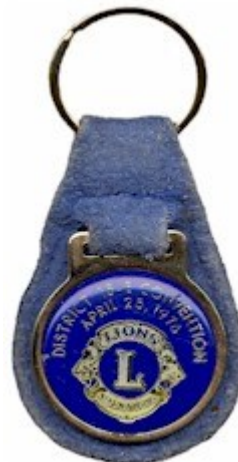
1976 District 13E Convention Key Chain