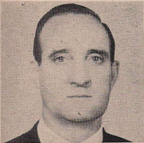
Vicente Ferrer Segura