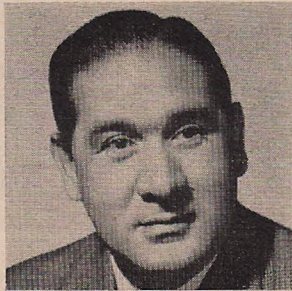
Hernando Franco I.