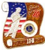
1976 "White" Minuteman