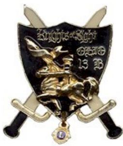
1979 "Gold" Knight