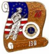
1976 "Silver" Minuteman