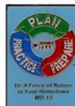
District 13F "Alert"