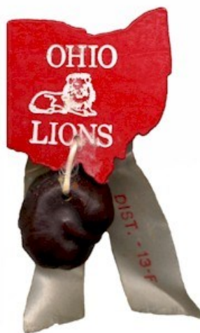
District Convention hand out pin. ( year unknown )