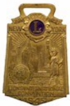
July 18-21,1949 32nd AC New York, NY.