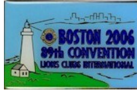
*June 30-July 4,2006 89th AC Boston, MA.