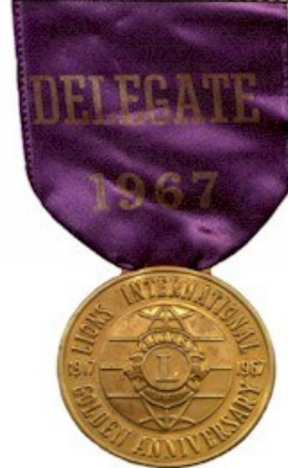
July 5-8, 1967 50th AC Chicago, IL.