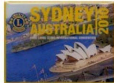
June 28-July 2, 2010 93rd AC Sydney, Australia.