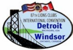
July 5-9,2004 87th AC Detroit, MI/ Windsor, Ontario, Canada.