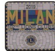
July 5-9, 2019 102nd AC Milan, Italy

June 26-30 2020 Singapore Cancelled due to COVID-19