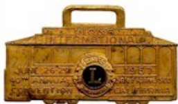
June 26-29,1957 40th AC San Francisco, CA.