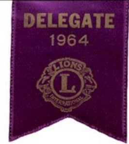
July 8-11, 1964 47th AC Toronto, Ontario, Canada.