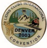
#June 30-July 4,2003 86th AC Denver, CO.