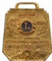
July 9-12,1958 41st AC Chicago, IL.

Note Annual Convention abbreviated to AC