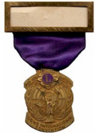
July 26-29,1948 31st AC New York, NY