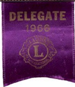
July 6-9, 1966 49th AC New York, NY.