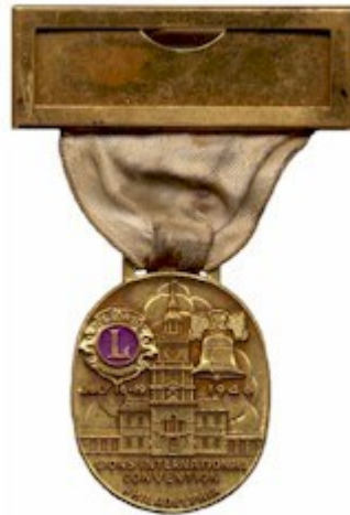
July 16-19,1946 29th AC Philadelphia,