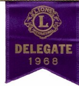
June 26-29, 1968 51st AC Dallas, TX.