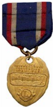
#June 15-18,1927 11th AC Miami, FL.