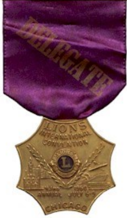
July 6-9, 1960 43rd AC Chicago, IL.