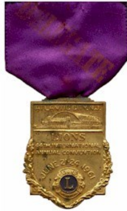
June 21-24, 1961 44th AC Atlantic City, NJ.