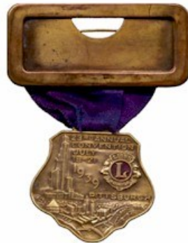
July 18-20,1939 23rd AC Pittsburg, PA.