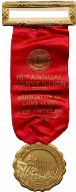
*July 19-22,1932 16th AC Los Angeles, CA.