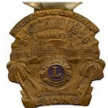
June27-30,1956 39th AC Miami, FL