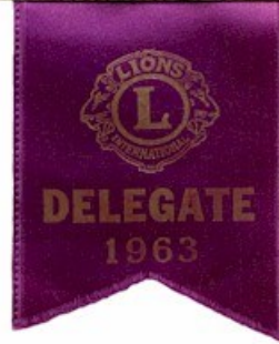
June 19-22, 1963 46th AC Miami, FL