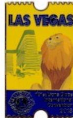
June 28 - July 3,2018 101st AC Las Vegas, NV.