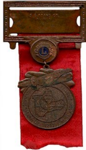
*July 11-14,1933 17th AC St. Louis, MO. 1933