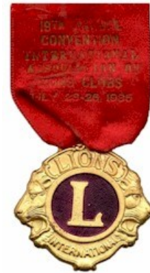
*July 23-25,1935 19th AC Mexico City, Mexico.